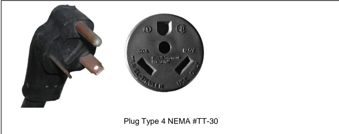
Plug Type 4 NEMA #TT-30